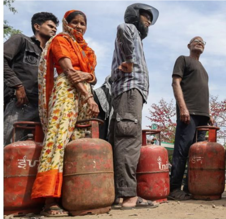
People wait to fill their empty LPG cylinders in New Delhi, after supply crisis due to war in Iran.